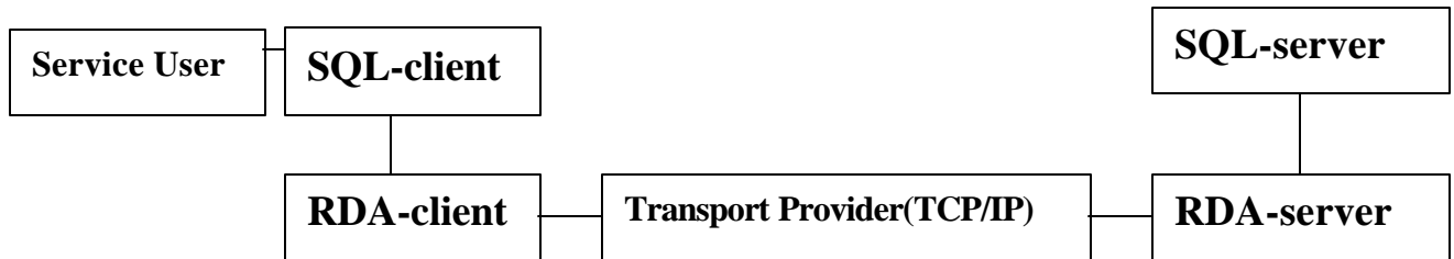
Figure 1 - RDA3 model of SQL-environment

The model adopted by this International Standard is that an RDA-client environment, which includes a Service User and an SQL-client, uses one or more Transport Providers to connect to RDA-server environments, each of which has one or more SQL-servers associated with it thereby establishing SQL-sessions between the SQL-client and the SQL-servers. Each SQL-session is associated with an SQL-connection. These are in turn supported by Transport Connections within Transport Providers that are established and terminated as required for communicating through the SQL-connection.